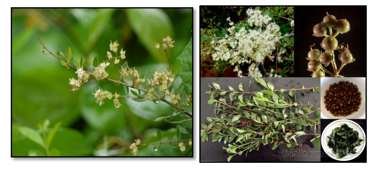
FIG. 1: HENNA PLANT

hepatoprotective, central nervous, analgesic, antiinflammatory, antipyretic, wound and burn healing, immunomodulatory, antiurolithiatic, antidiabetic, hypolipidemic, antiulcer, antidiarrhoeal, diuretics, anticancer and many other pharmacological effects.